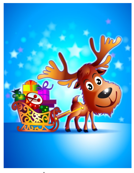
Merry Christmas & Happy New Year

The NEA will be closed on Tuesday, December 25th for the Christmas Holiday & on Tues, January 1st for the New Year's Holiday.