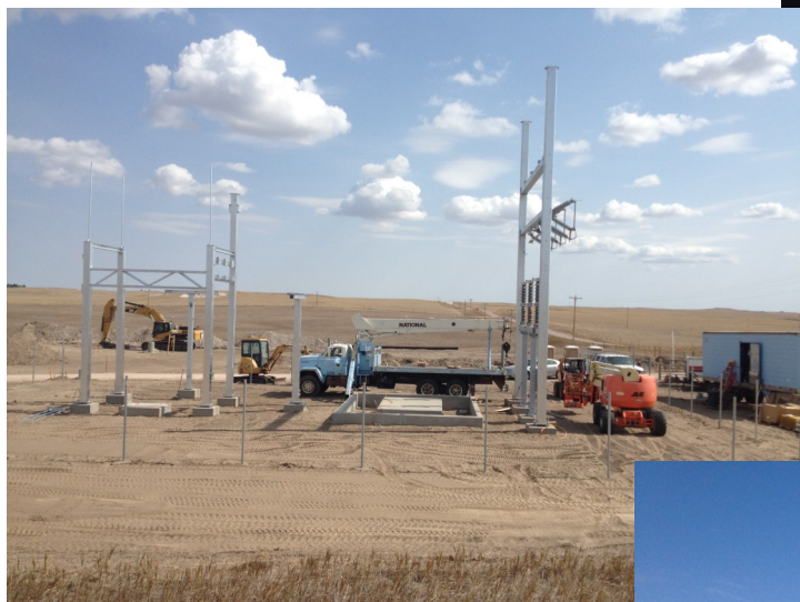
Midpoint perspective of the progression in substation construction.

The 39,800 lbs substation transformer, crane set in place, on its pad mount.