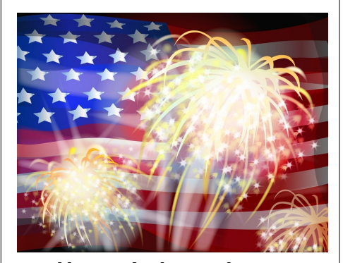
Happy Independence Day!!!

INSIDE THIS ISSUE: Annual Meeting 1 Pictures from Annual Meeting 2 When the Lights Go Out - NEA. 3 Manager's Note 4 Boardroom News 4