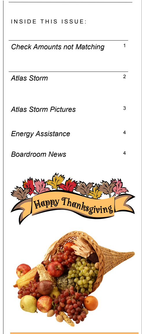
NSA will be closed Thursday the 28th and Friday the 29th of November for the holiday.