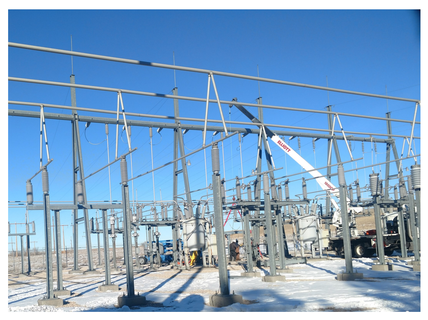
Recently, Tri-State G&T brought in a crane to work in Podolak Substation replacing CTs (Podolak is the main substation that feeds all our distribution). See Manager's article on page 4.

This institution is an equal opportunity provider and employer. If you wish to file a Civil Rights program complaint of discrimination, complete the USDA Program Discrimination Complaint Form, found online at <a href="https://www.ascr.usda.gov/">https://www.ascr.usda.gov/</a>, or at any USDA office, or call (866) 632-9992 to request the form. You may also write a letter containing all of the information requested in the form. Send your completed complaint form or letter to us by mail at U.S. Department of Agriculture, Director, Office of Adjudication, 1400 Independence Avenue, S.W., Washington, D.C. 20250-9410, by fax (202) 690-7442 or email at <a href="mailto:program.intake@usda.gov">program.intake@usda.gov</a>