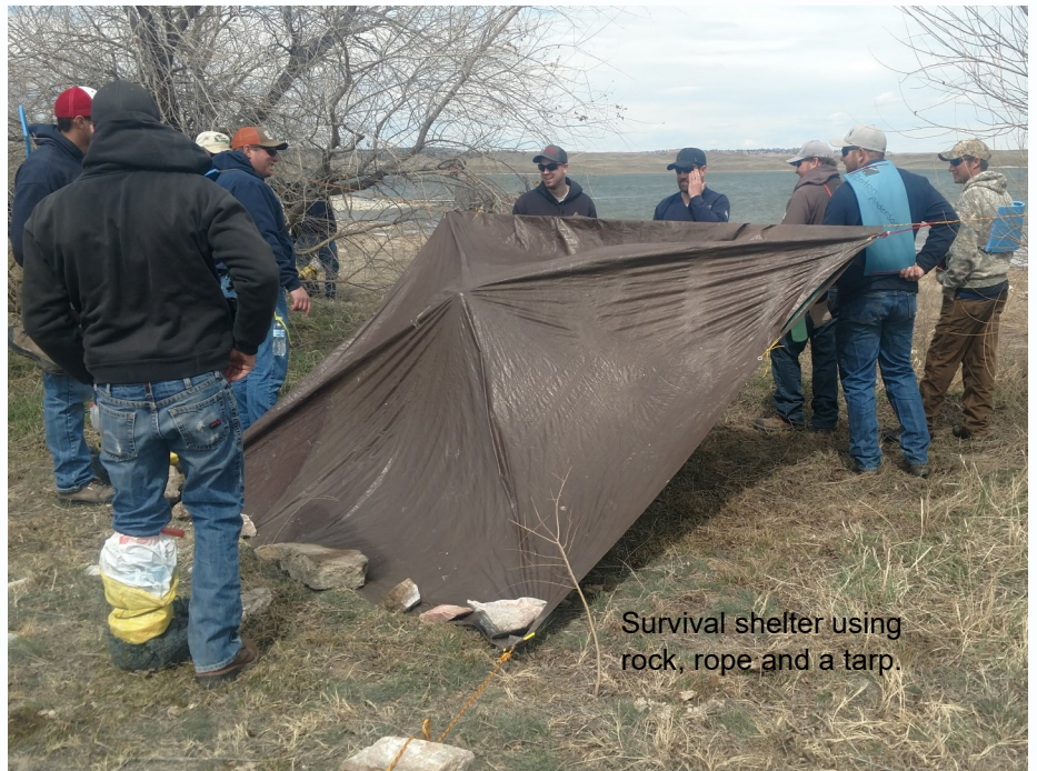
Survival shelter using rock, rope and a tarp.

A winter survival class was recently put on by our Co-op neighbor, Wheatland REA.