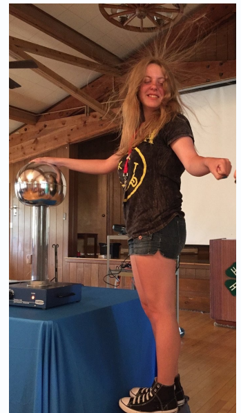
Youth Tour Camper using the Van de Graaff generator used in the Power Behind the Switch program.